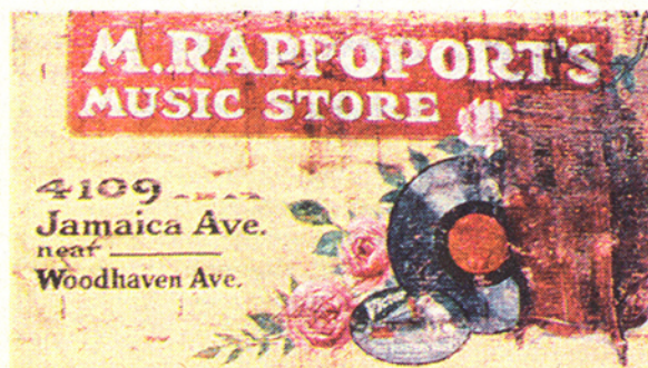
Jamaica Avenue near Woodhaven Boulevard, Queens

On brick buildings around New York, painted ads for vanished products and services preserve an era of elixirs, nostrums and horse-drawn carriages. The photographer sees them as "metaphors for survival," since they have long outlived any commercial usefulness. Page B2.